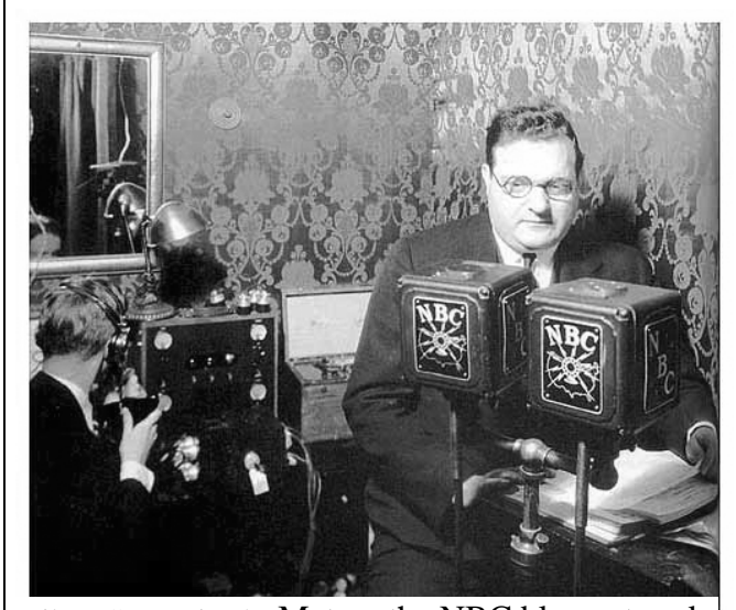
Milton Cross, airs the Met on the NBC blue network

Beyond the millions of dollars Texaco paid as the Met's long-time radio sponsor, fundraising has been accomplished through the popular intermission features on the broadcast including discussion of the particular day's opera, background pieces, occasional singer interviews or round tables and the opera quiz.